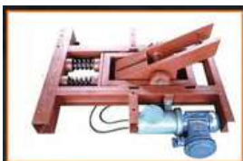
Electrical mine car stopper