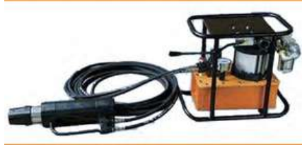
Pneumatic anchor cable tensioning machine