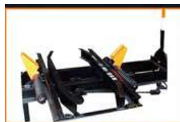
Manual mine car stopper