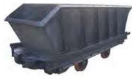
Bottom discharge mine car