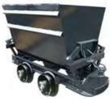
Bucket tipping mine car