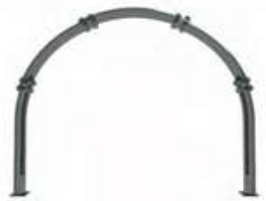
Standard semi circular arch bracket