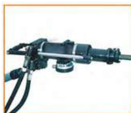
Hydraulic rock drill