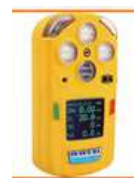
Multi gas detector