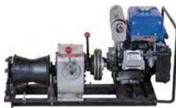
Cable pulling winch