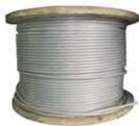
Steel wire rope