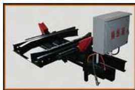
Pneumatic mine car stopper