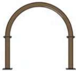
Miner steel bracket