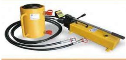
Hydraulic anchor cable tensioning machine