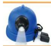
Mine lamp cap