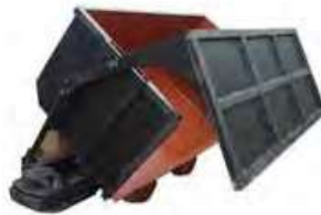
Side discharge mine car