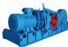
Double speed winch