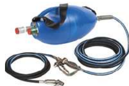
Jack pot pump