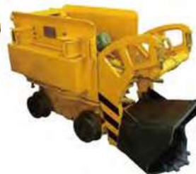
Electrical rock loader