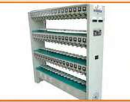
Mine lamp charging rack