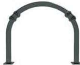
Single section beam