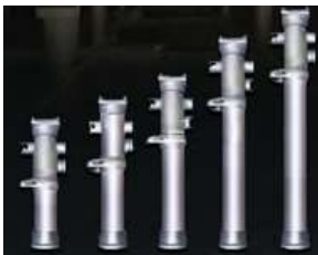
Single hydraulic probs